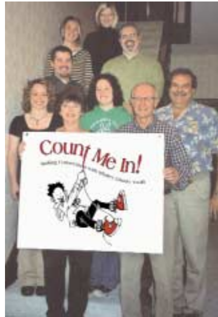
Members of the Count Me In! Steering Committee work to connect Whitley County youth with caring adults.