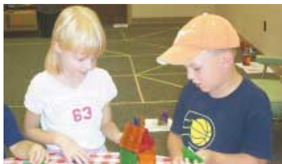
Little folks enjoy the newly improved children's area of the South Whitley Library.