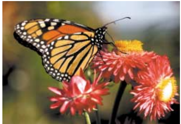
A new endowment fund was started for ACRES Land Trust in 2006.

Unrestricted — The grants can be directed wherever the current charitable need is the greatest in Whitley County.