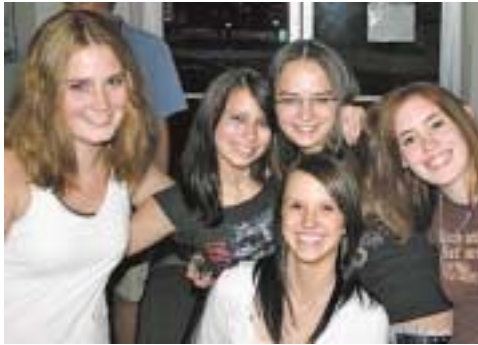
Local youth gather at The Center for socializing.

Ever wonder why, given a level playing field, some children thrive in a community while others turn to risky behavior? The Minneapolis-based Search Institute identified 40 building blocks of development that help young people grow up healthy, caring, and responsible. Research shows that kids who have a lot of assets are more likely to do well in school, volunteer in the community and care about others. Kids who have lots of assets are less likely to use tobacco or drugs or be sexually active.