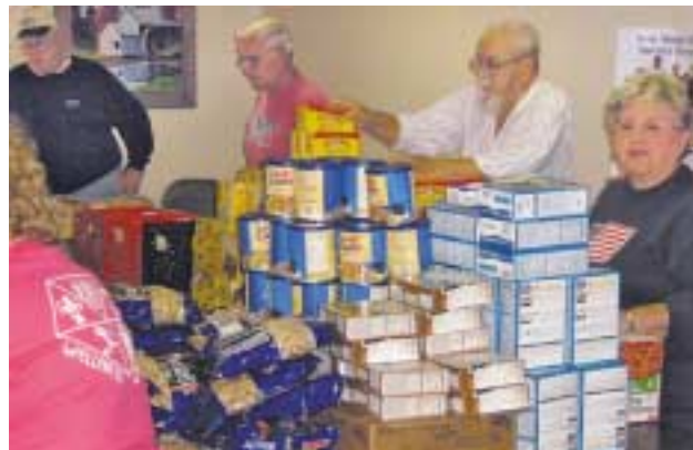
Volunteers for the Whitley County Council on Aging and the Aged provide groceries to local seniors in need.