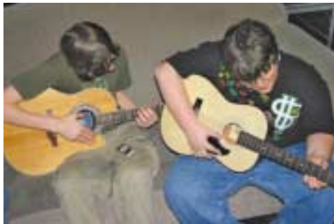
Students enjoy using The Center as a place to have fun and be creative.

The Whitley County Community Foundation embraced the 40 Developmental Assets message and in response, created Count Me In!, a program designed to connect Whitley County youth with caring adults who are willing to share their time and talents with local youngsters.