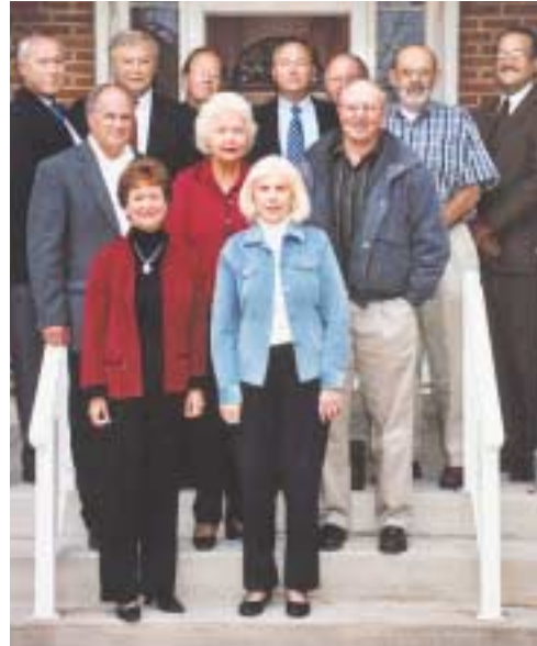
Whitley County Community Foundation Board of Directors