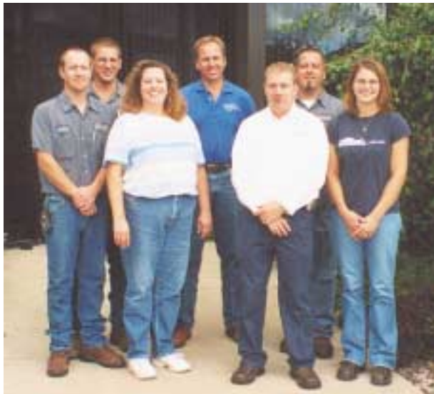
Micropulse employees are active participants in corporate philanthropy. In 2005 and 2006, over 100 charities benefited from their generosity.

Each member of the Micropulse team is encouraged to direct charitable gifts from company profits to their favorite causes through the Community Foundation. While many employees opt to support Whitley County programs such as the Humane Society or Passages, others have chosen to direct funding to projects as close to home as Erin's House and the Fort Wayne Children's Zoo, and far as away as Africa for a literacy program.